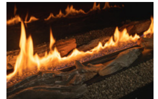
optional ceramic logs or white stones (installed on top of the burner)